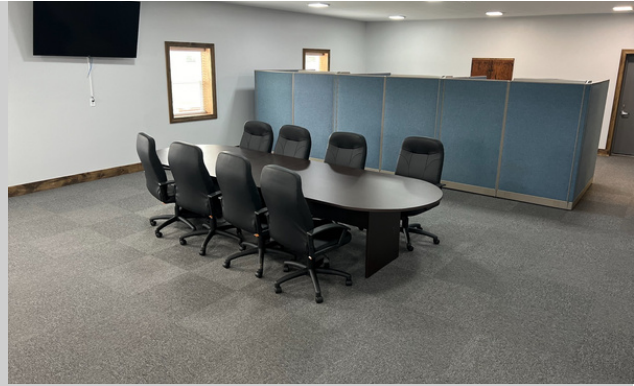
Administration Building Conference Room.

This spring, the administration building received an upgrade with a new conference room. The new room will provide ample area and a comfortable space for the township administrative staff members to conduct small meetings such as zoning-related discussions, or to review files, maps, plans, and even large drawings. The three old garage bays on the east side of the building were renovated to create the new, approximately 936-square foot, conference room. Without contracting outside labor, our own service department removed the garage doors, framed in doorways, completed drywall, finished the ceiling, painted, installed trim, installed new LED light fixtures, installed a new countertop, cabinets, and even a small kitchen sink! New carpeting was installed in mid-March. This was accomplished by using funds available through the American Rescue Plan Act grant and was completed at NO ADDITIONAL COST to township residents.